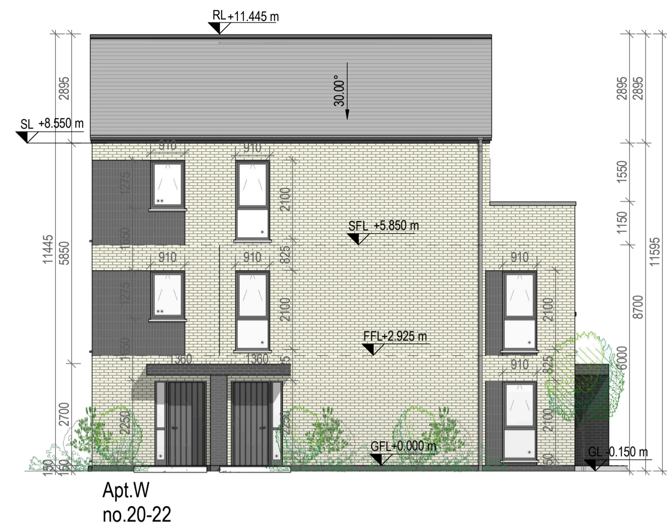
3 Side Elevation 1 1 : 100