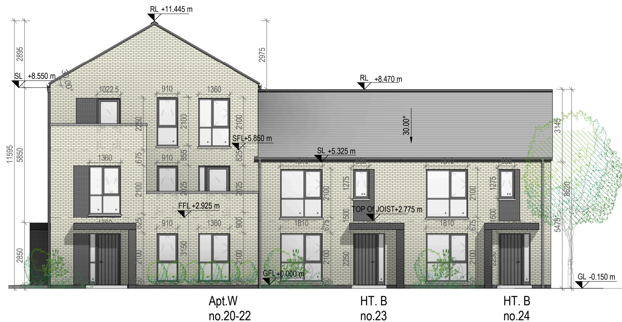
1 Front Elevation 1 : 100