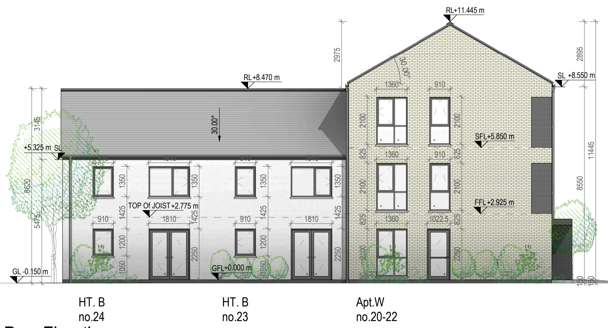
2 Rear Elevation 1 : 100